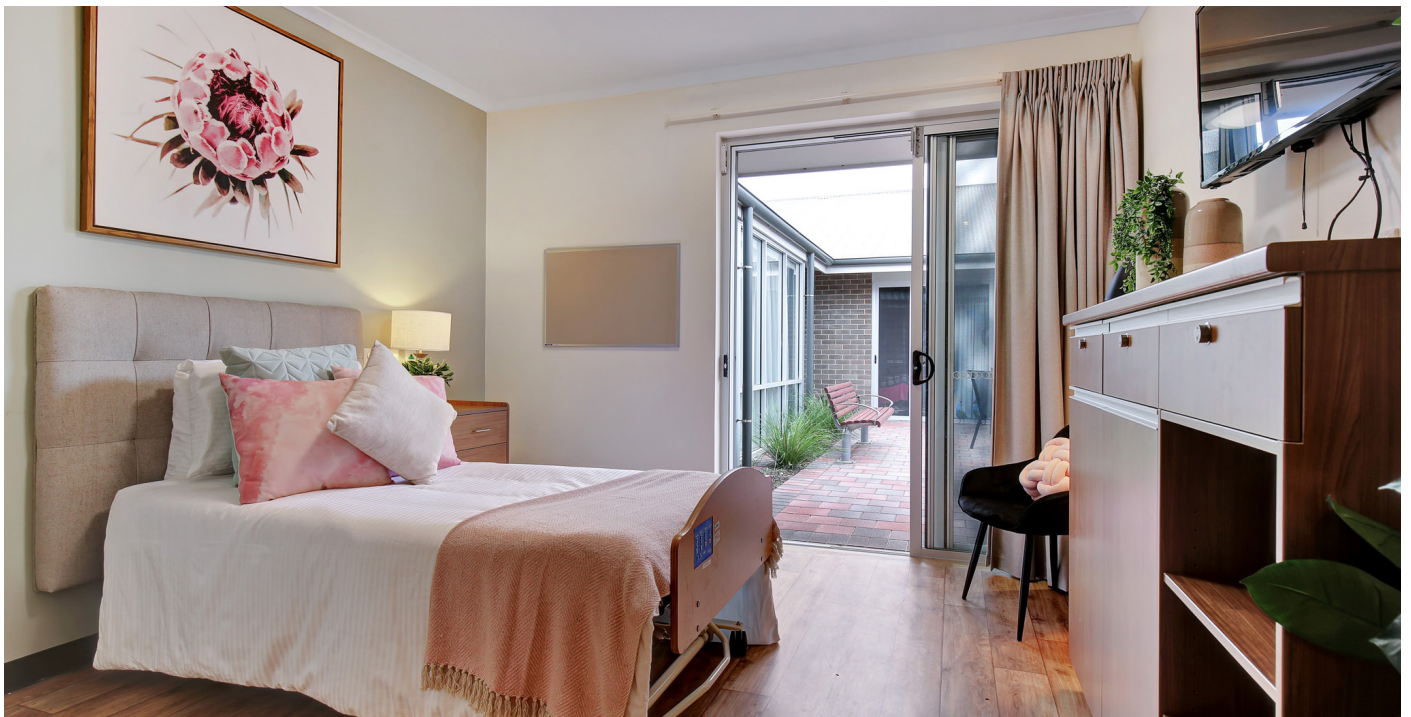
Single resident room with ensuite and courtyard access