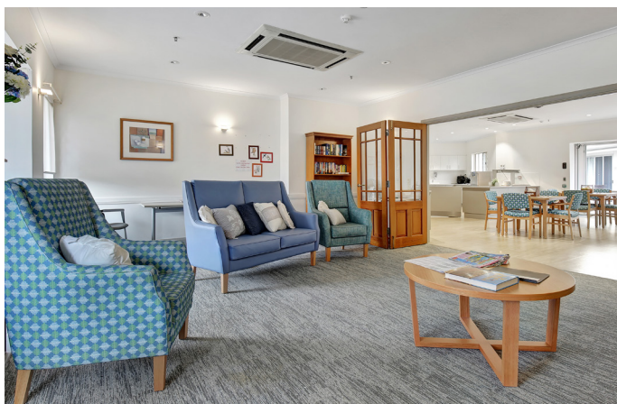
Lounge and games room