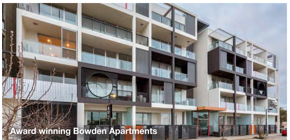
Award winning Bowden Apartments